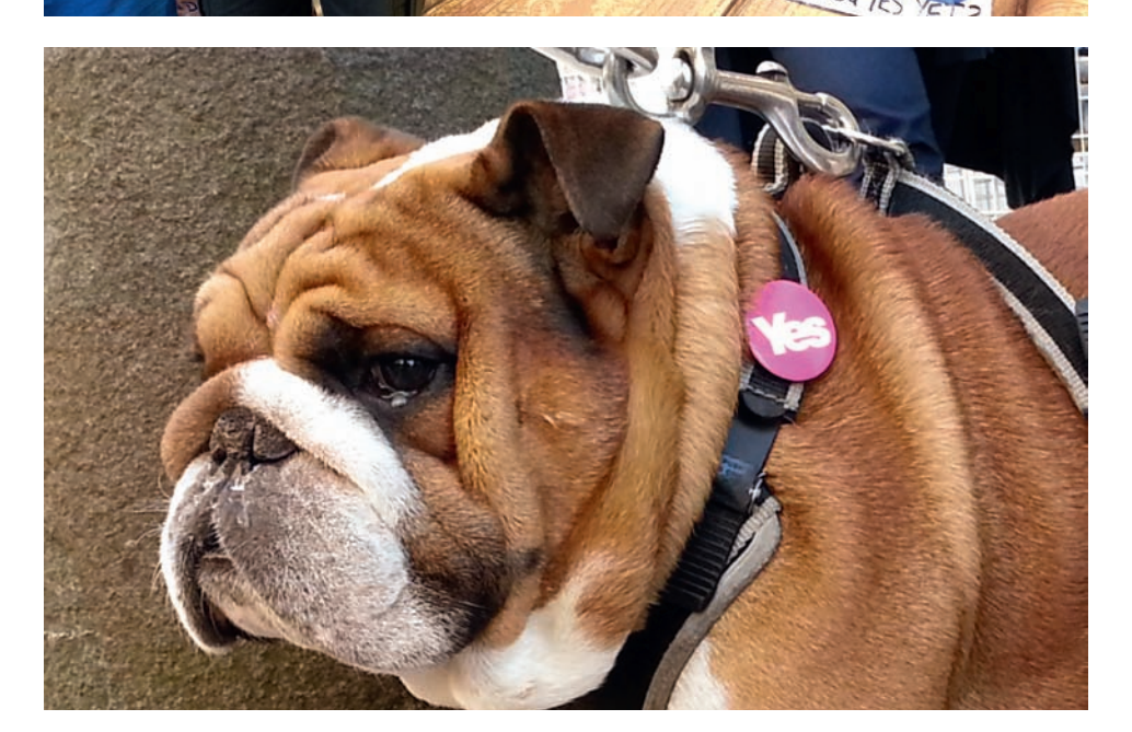
YES for independence: 45 per cent of Scottish society questions the sense of the union with England, Wales and Northern Ireland, and express this in various ways.

British politicians will have to redefine the vision of the United Kingdom's future and reassess the reasons why its component parts should indeed remain together in the new century.