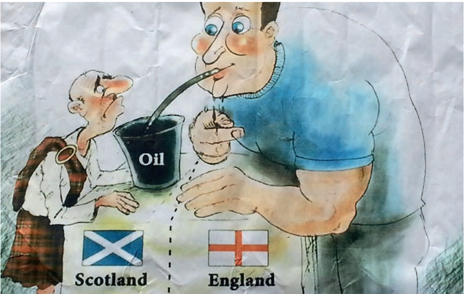
The Scots decided to remain part of the United Kingdom, however, London should not feel triumphant, as tensions will remain.