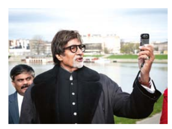
"Kraków, the original capital city of Poland has converted me into a fan of endless proportions." Amitabh Bachchan, after visit to Kraków in 2011

Poland's membership in the EU meant access to billions of euros in structural and cohesion funds to support infrastructure development, environmental protection and environmental remediation projects. Between 2007 and 2015, Poland was the EU's largest recipient of funding, receiving EUR 67 billion (USD 90 billion) in total from the EU's budget. Another EUR 82.5 billion for Poland is allocated in the EU's financial framework for 2014-2020.